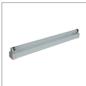
Corp fluorescent tip SS30 EUR 21.00 cu un tub D-170 - A Cod 019.010.190.001