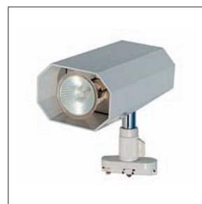
Spot halogen SY STAR 50W(A) EUR 18.00 Cod 019.010.186.000