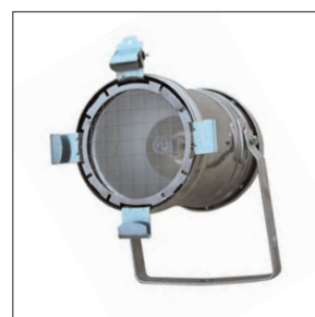
Reflector HIGHLITE HQI 150WEUR 40.00 Cod 019.010.390.000