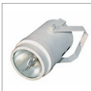
Reflector HQI 80W EUR 40.00 Cod 019.010.200.030