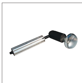
Lampa spot stut OCTANORM EUR 15.00 Cod 019.010.187.000