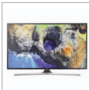
TV SAMSUNG UHD, EUR 65.00/zi (diagonala ecran: 163 cm) Cod 025 010 130 047