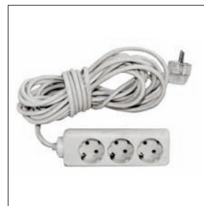
Prelungitor 230V, 10A, 5m EUR 12.00 Cod 019.010.279.000