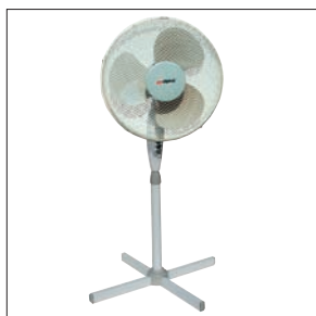
Ventilator cu picior EUR 9.00 Cod 025.010.500.020