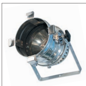
Reflector PAR64 500-1000W EUR 45.00 Cod 019.010.200.020