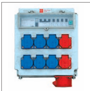
Panou Electric EUR 130.00 OCTANORM Cod 019.010.275.000