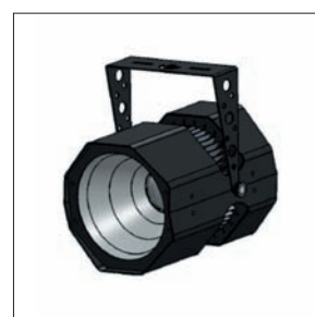
Reflector LED VIRGO EUR 45.00 40W 4350 LM 4100 K Cod 019.010.200.045