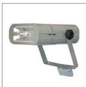
Reflector IVEN HQI 150W EUR 40.00 Cod 019.010.200.005