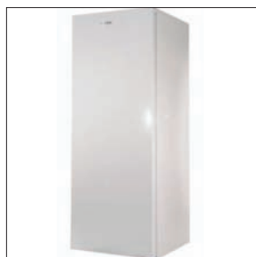
Frigider ARCTIC 255 I EUR 60.00 Cod 025 010 020 199