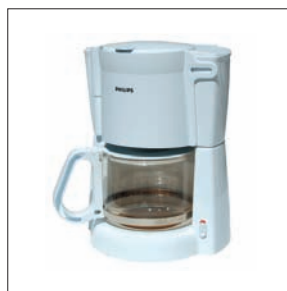
Filtru de cafea EUR 6.00 Cod 025.010.120.010