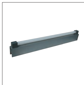
Corp fluorescent tip SS30 EUR 18.00 cu un tub D-170 Cod 019.010.190.000