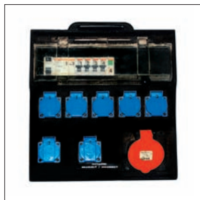
Panou Electric 380V/220V EUR 110.00 Cod 019.010.265.000