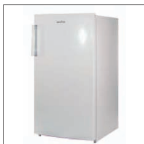
Frigider ARCTIC FB 155 EUR 28.00 Cod 025 010 020 198