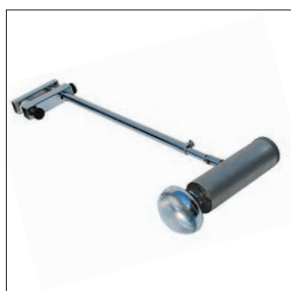
Lampa spot cu brat 100W EUR 15.00 Cod 019.010.181.000