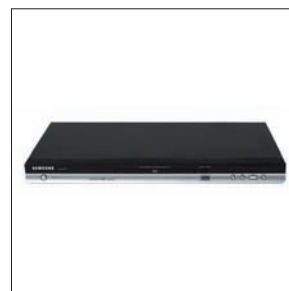
DVD Player EUR 45.00 Cod 025 010 130 030