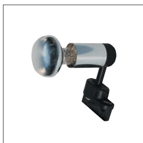
Lampa spot 100W EUR 15.00 Cod 019.010.188.000