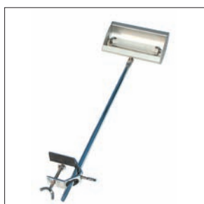
Reflector cu brat 300W EUR 40.00 Cod 019.010.200.010