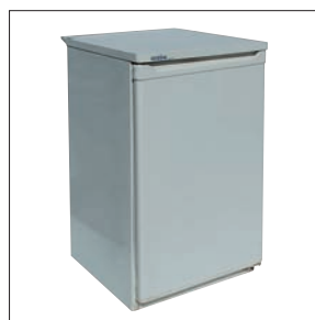
Frigider ARCTIC (180 l) EUR 49.00 Cod 025 010 070 020