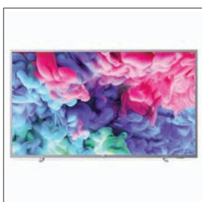
TV LED SMART 4K, EUR 45.00/zi UHD ultrasubtire (diagonala ecran: 126 cm) Cod 025 010 130 045