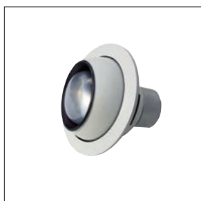
Lampa spot 100W EUR 15.00 Cod 019.010.170.000