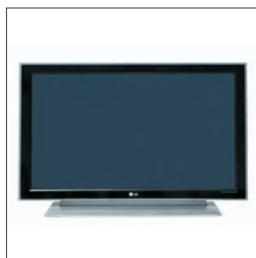
TV Plasma EUR 28.00/zi (diagonala ecran: 107 cm) Cod 025 010 130 040