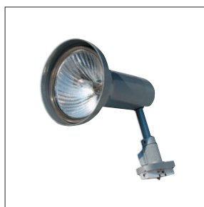
Spot halogen SY STAR 100W EUR 18.00 Cod 019.010.185.000