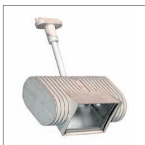
Reflector halogen SYMA STAR 300W EUR 40.00 Cod 019.010.200.006