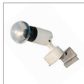
Lampa spot SS30 100W EUR 15.00 Cod 019.010.200.008