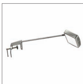
Reflector tija LED A++ EUR 40.00 16W 1100LM 4000K ARM33CM Cod 019.010.200.040