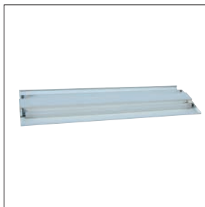
Corp fluorescent tip EUR 23.00 OCTANORM cu doua tuburi D-171 Cod 019.010.200.000