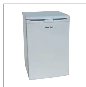
Racitor (140 l) EUR 28.00 Cod 025 010 070 010 (55 x 61 x 84 cm)