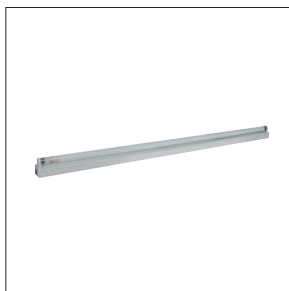
Lampa fluorescenta FIA EUR 18.00 cu instalatie electrica completa 1x40W Cod 019.010.110.000