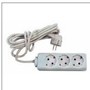
Prelungitor 230V, 10A, 3m EUR 12.00 Cod 019.010.277.000