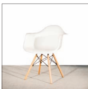
Eames chair-white EUR 18.00 Code 025.010.040.150 (61 x 62 x 77.5 cm)