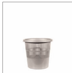
Plastic recycle bin EUR 6.00 (black) Code 025.010.120.030