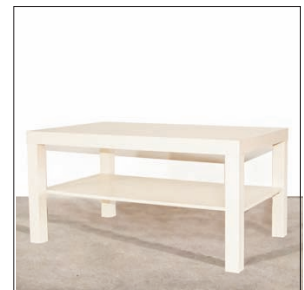
Coffee table 90/55 white EUR 9.00 Code 025.010.020.196 (90 x 55 x 45 cm)