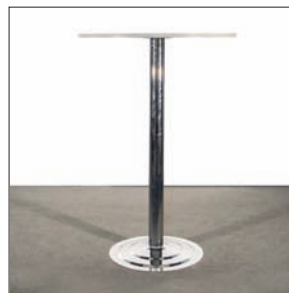
Total Mob table tall, snack-bar EUR 21.00 Code 025.010.030.044 (80 cm diameter; H: 110 cm)