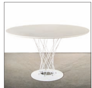
Domicilio table EUR 90.00 Code 025.010.020.150 (120 cm diameter; H: 70 cm)