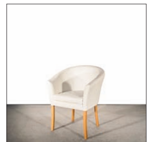
Cafe armchair, white EUR 31.00 Code 025.010.010.025 (70 x 70 x 80 cm)