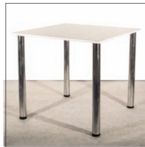
Milano table EUR 21.00 Code 025.010.020.090 (80x80x72 cm)