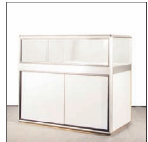
SYMA desk showcase EUR 45.00 Code 025.010.150.080 (100 x 50 x 70 cm)