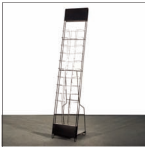
Metal stand for presentation EUR 65.00 Code 025.010.120.167