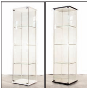
Showcase glass door EUR 60.00 Code 025.010.200.035-white Code 025.010.200.036-black (40 x 35 x 164 cm)