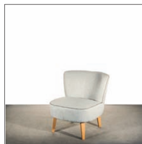
Jim armchair - gray EUR 45.00 Code 025.010.010.060 (60 x 60 x 75 cm)