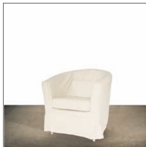
Armchair with cover EUR 26.00 Code 025.010.010.020 (80 x 70 x 80 cm)