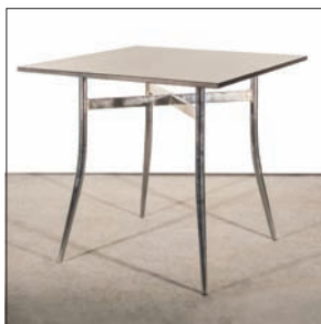
Total Mob table EUR 21.00 Code 025.010.020.083 (80x80x73 cm)