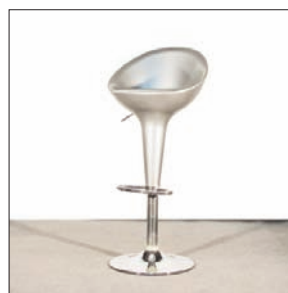
ABS bar stool EUR 12.00 Code 025.010.040.082 – grey Code 025.010.040.083 – red Code 025.010.040.085 – orange