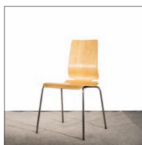
Gilbert chair EUR 11.00 Code 025.010.040.043 – oak Code 025.010.040.044 – white Code 025.010.040.045 – black