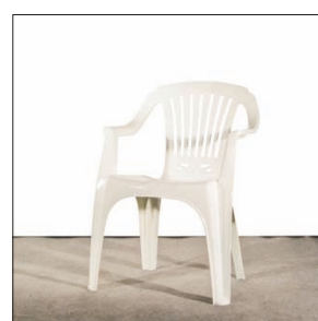
Plastic chair EUR 6.00 (white) Code 025.010.040.060