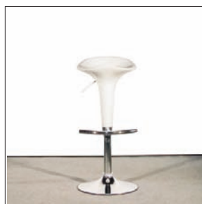
Vida ABS bar stool-white EUR 12.00 Code 025.010.040.170 (38 x 36 x 66-87 cm)