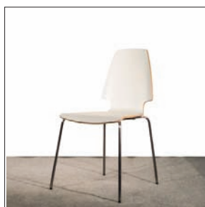
White veneer chair EUR 11.00 (steel frame) Code 025.010.040.050