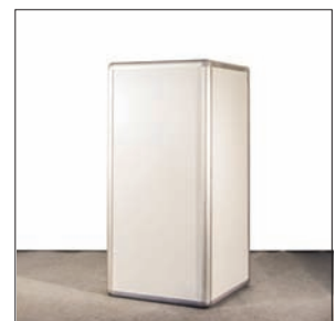
Display parallelepiped (high) EUR 21.00 Code 024.000.140.020 (50 x 50 x 100 cm)