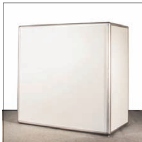
Information desk EUR 38.00 Code 024.000.140.080 (90 x 50 x 100 cm)