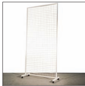
Grid stender EUR 21.00 Code 025.010.120.169 (100 x 200 cm)