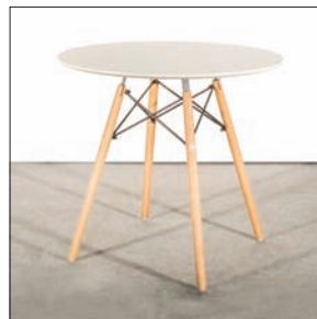
Marta table EUR 24.00 Code 025.010.020.190 (80 cm diameter; H: 73 cm)