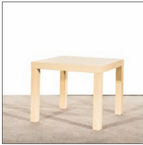
Coffee table 55/55 EUR 21.00 birch effect Code 025.010.030.055 (55 x 55 x 45 cm)