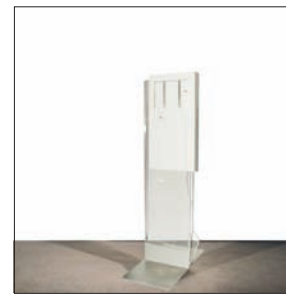
Display info - tablet support EUR 170.00 Code 025.010.150.045 (153 x 40,3 cm)