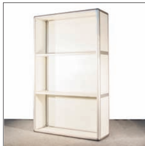
Shelves rack EUR 38.00 Code 024.000.140.070 (94 x 29 x 150 cm)