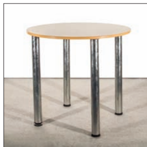
Oak round table EUR 21.00 Code 025.010.020.091 (80 cm diameter; H: 73 cm)