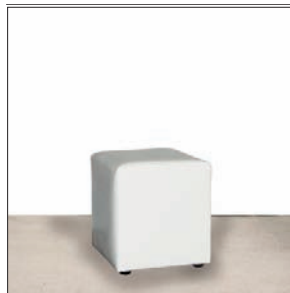
White stool EUR 9.00 Code 025.010.040.025