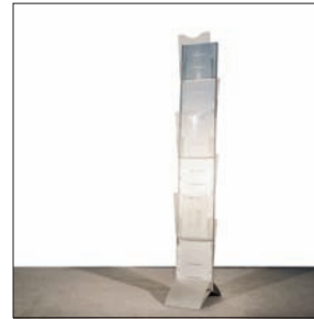
Display support vertical EUR 44.00 Code 025.010.150.041