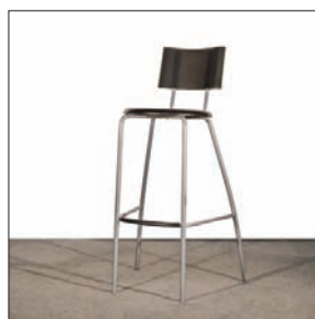
ANSSI bar stool EUR 12.00 (with back) Code 025.010.040.084