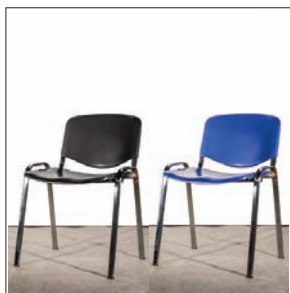
Leda chair EUR 11.00 (nickeled) Code 025.010.040.040 - black Code 025.010.040.120 - blue