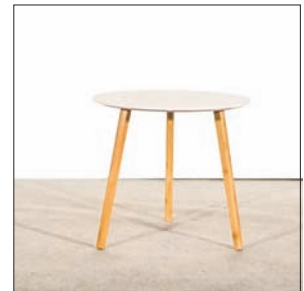
Winter coffee table EUR 12.00 Code 025.010.020.192 (50 cm diameter; H: 45 cm)