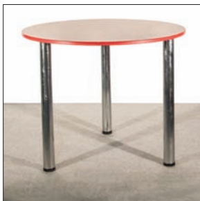
Round table EUR 21.00 Code 025.010.020.093 – white (80 cm diameter)