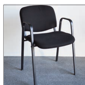
Rio CN Maxi chair EUR 11.00 Code 025.010.040.032