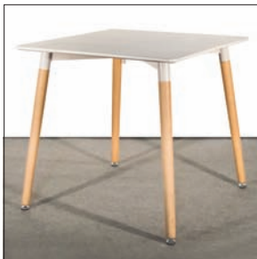
Eames square table EUR 36.00 Code 025.010.020.160 (80 x 80 x 74 cm)