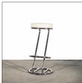
White bar stool EUR 11.00 Code 025.010.040.079