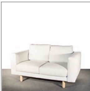
2 seats sofa with cover EUR 72.00 Code 025.010.010.070 (160 x 90 x 70 cm)