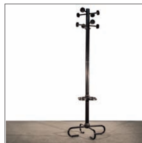
Prisma clothes hanger EUR 11.00 (black) Code 025.010.060.050