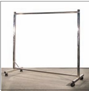
Exhibiting stender EUR 26.00 Code 025.010.120.160