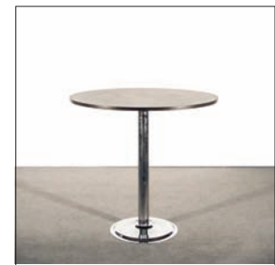
Total Mob table EUR 21.00 Code 025.010.030.045 (80 cm diameter; H: 73 cm)