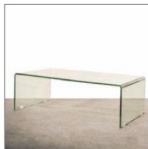
Linda coffee table - glass EUR 30.00 Code 025.010.020.180 (110 x 60 x 35 cm)