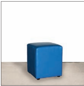
Blue stool EUR 9.00 Code 025.010.040.024