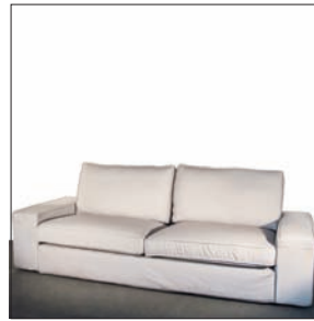
3 seats sofa with cover EUR 100.00 Code 025.010.010.080 (230 x 90 x 70 cm)