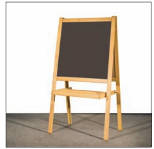
Wooden easel EUR 14.00 Code 025.010.120.168