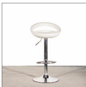
Miami ABS bar stool-white EUR 12.00 Code 025.010.040.160 (47 x 40 x 60-80 cm)