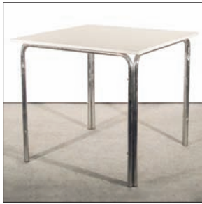
Viena table EUR 21.00 Code 025.010.020.010 (80x80x70 cm)