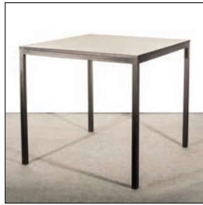
Germania table EUR 21.00 Code 025.010.020.080 (80x80x72 cm)