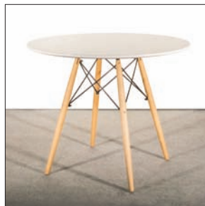
Eames round table EUR 36.00 Code 025.010.020.170 (90 cm diameter; H: 75 cm)