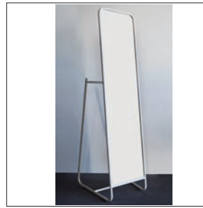
Mirror EUR 21.00 Code 025.010.120.180 (48x160 cm 2 )