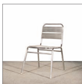
Aluminium chair EUR 15.00 Code 025.010.040.015