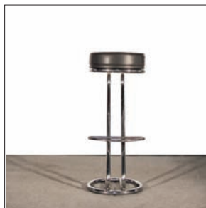
Black bar stool EUR 11.00 Code 025.010.040.080