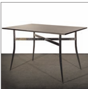
Total Mob table (black) EUR 21.00 Code 025.010.020.021 (120x80x73 cm)