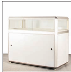
SMADO showcase desk EUR 45.00 Code 025.010.160.040 (100 x 50 x 70 cm)