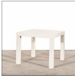
Coffee table 55/55 EUR 21.00 Code 025.010.030.050 (55 x 55 x 45 cm)