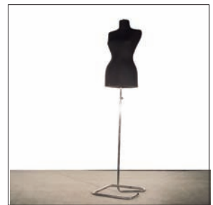
Tailoring bust EUR 26.00 Code 025.010.400.010