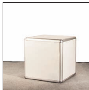
Display cube EUR 18.00 Code 024.000.140.010 (50 x 50 x 50 cm)