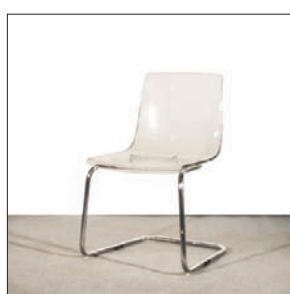
Clear plastic chair EUR 11.00 Code 025.010.040.035