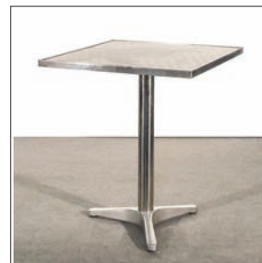
Aluminium table EUR 21.00 (square) Code 025.010.020.000 (60x60x68 cm)