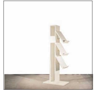
PAL leaflets support EUR 44.00 Code 025.010.150.040