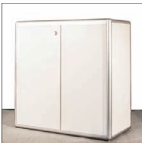
Locker EUR 38.00 Code 024.000.140.040 (100 x 50 x 96 cm)