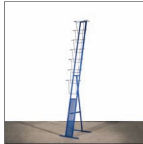
Brochures expo stender EUR 44.00 Code 025.010.150.042