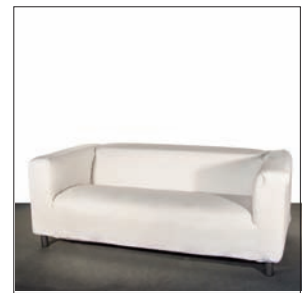
2 seats sofa EUR 55.00 Code 025.010.010.030 (180 x 86 x 68 cm)